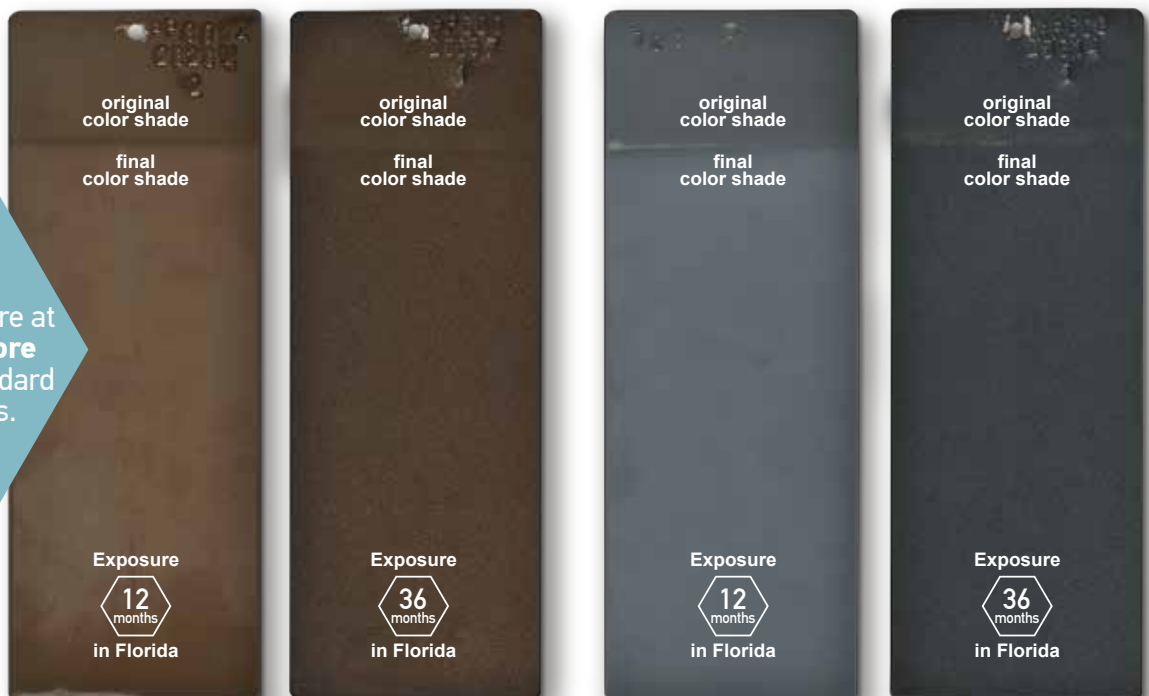
Super Durable Coatings

Super Durable Powder Coatings are at least 3 times more resistant than standard powder coatings.